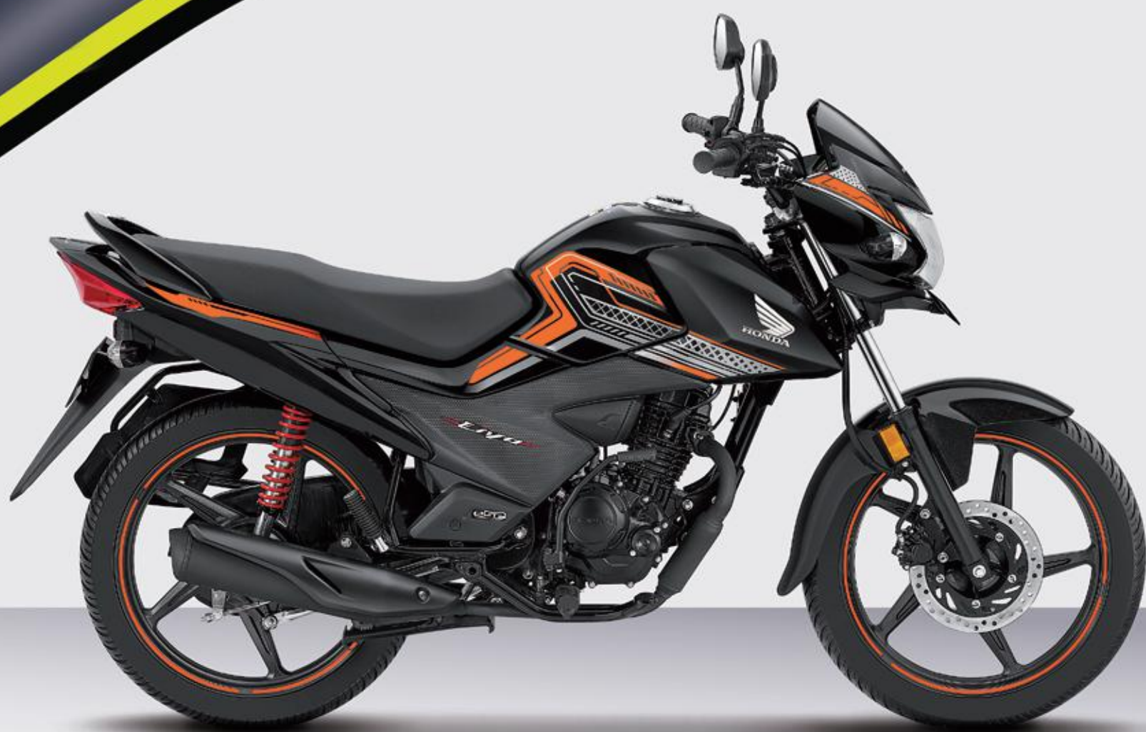
PEARL IGNEOUS BLACK (Pearl Igneous Black Shroud + Orange Stripes)