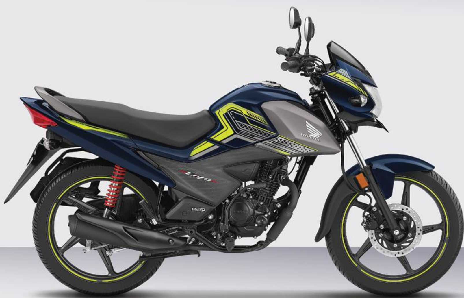
PEARL SIREN BLUE A (Geny Gray Shroud + Green Stripes)